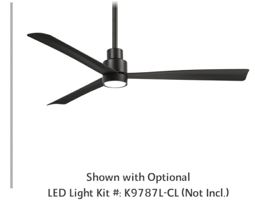
Shown with Optional LED Light Kit #: K9787L-CL (Not Incl.)